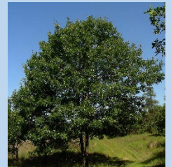
Velutina Black Oak