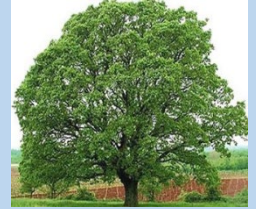
Alba White Oak