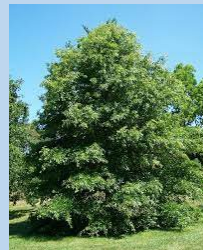
Pal Pin Oak