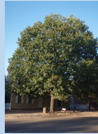
Rubra Red Oak

Return order form and payment to the Waldwick Clerks Department.