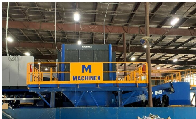
A photo of the IWS single stream facility located in North Arlington which is expected to open September 2024

Next up was Wayne DeFeo of DeFeo Associates and Essex County. He was on hand to discuss a possible bottle bill and the downside of it for recycling in New Jersey. He addressed the different groups that are supporting and opposing a bottle bill.